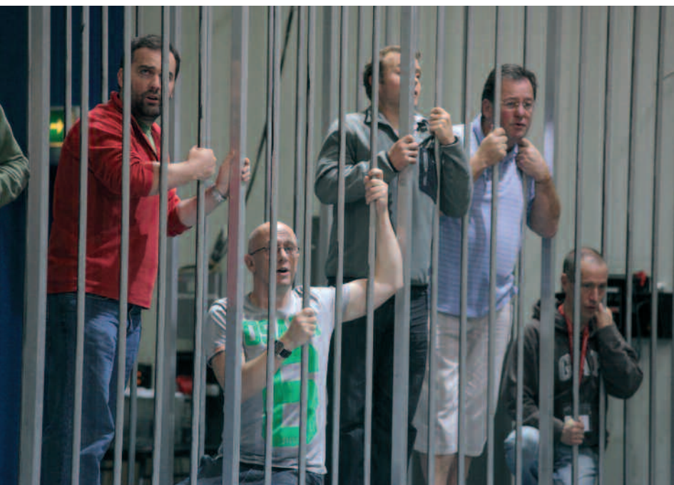
Chorus of WNO in rehearsal

person. He is faced with a choice, which all of us one day might have to confront in our own lives: to live in fear, corruption and cowardice, or to help oneself and others cast off the yoke of fear through moral courage and personal bravery. He offers an alternative that we all can choose; until enduring love becomes the catalyst for humankind; until all people can emerge from darkness into light, this is utopia. If anything can give us this hope to touch and to hold, it is Beethoven's music.