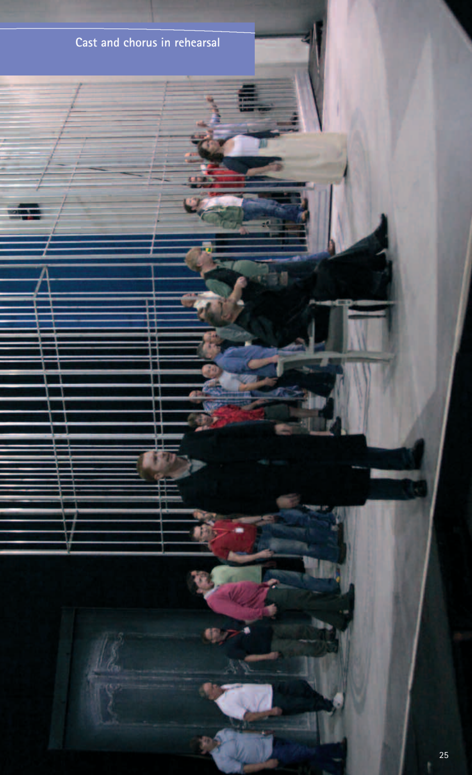
Cast and chorus in rehearsal